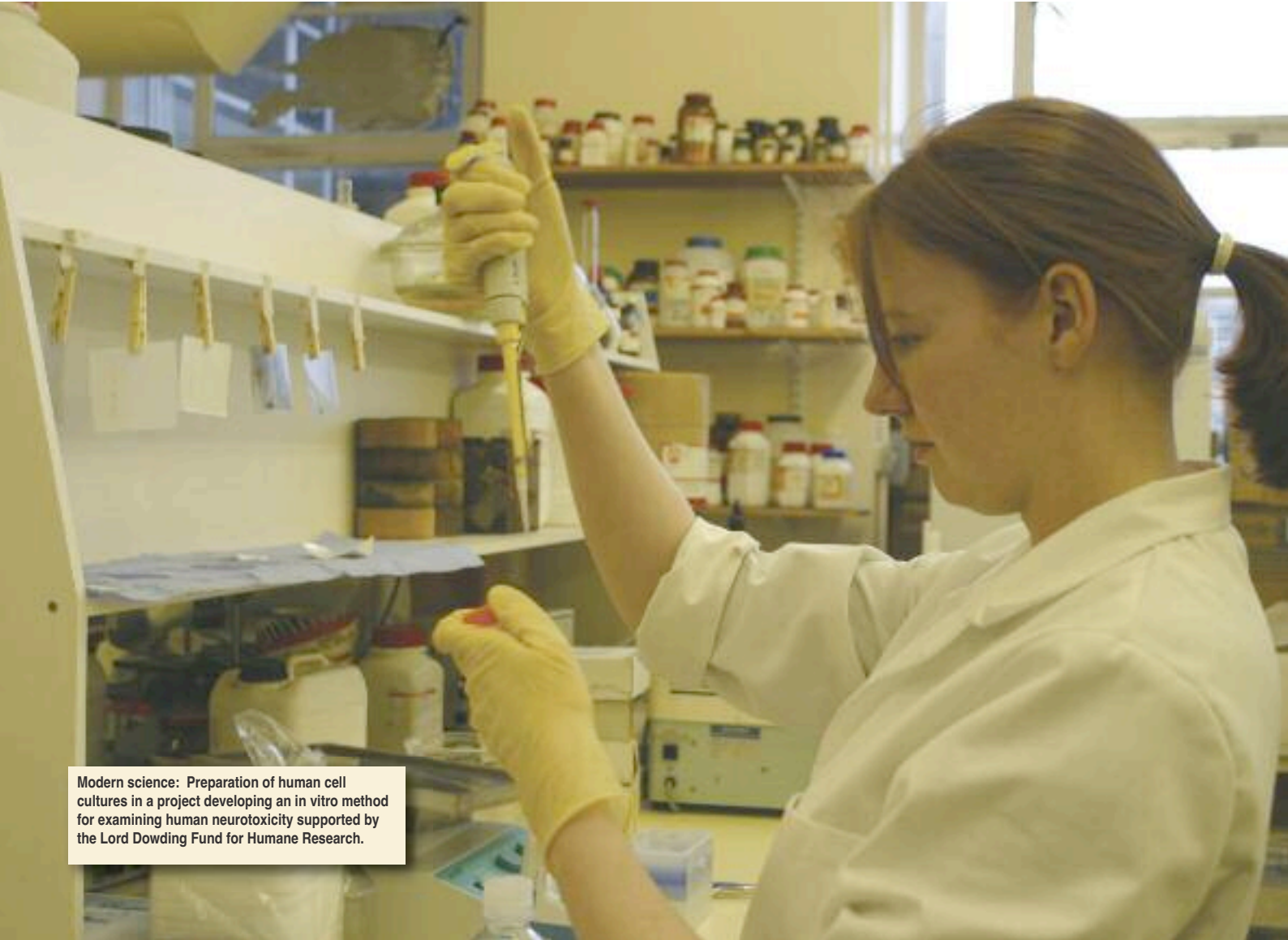
Modern science: Preparation of human cell cultures in a project developing an in vitro method for examining human neurotoxicity supported by the Lord Dowding Fund for Humane Research.

It is clear that the use of available human data is preferable to animal studies for such a disease. As far back as 2001, a study was conducted to examine the efficacy of a high-purity factor VIII/von Willebrand concentrate for treatment and prevention of bleeding. The study used 81 patients representing all 3 types of vWD and concluded “the concentrate effectively stopped active bleeding and provided adequate haemostasis for surgical or invasive procedures” 197 .