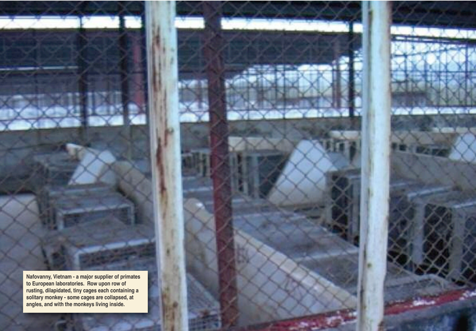
Nafovanny, Vietnam - a major supplier of primates to European laboratories. Row upon row of rusting, dilapidated, tiny cages each containing a solitary monkey - some cages are collapsed, at angles, and with the monkeys living inside.

heads and faces 37 ; the study notes for BVR0963 noted that one monkey arrived with bruising and a swollen orbital 38 ; a monkey in the stock building had skin looking sore and flaking off badly, requiring its feet and tail to be bathed in Malaseb for 10 minutes every other day; it was claimed the animal had arrived in that condition 39 .