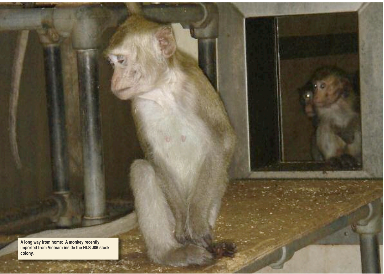
A long way from home: A monkey recently imported from Vietnam inside the HLS J06 stock colony.

It is of concern that regulatory tests conducted by contract testing laboratories, on behalf of clients such as drug