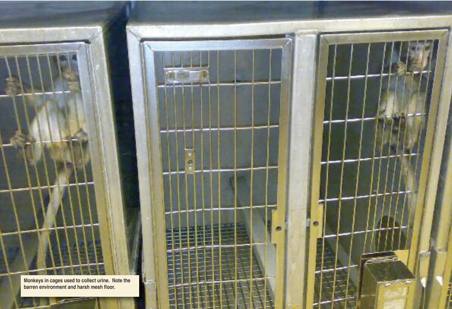
Monkeys in cages used to collect urine. Note the barren environment and harsh mesh floor.