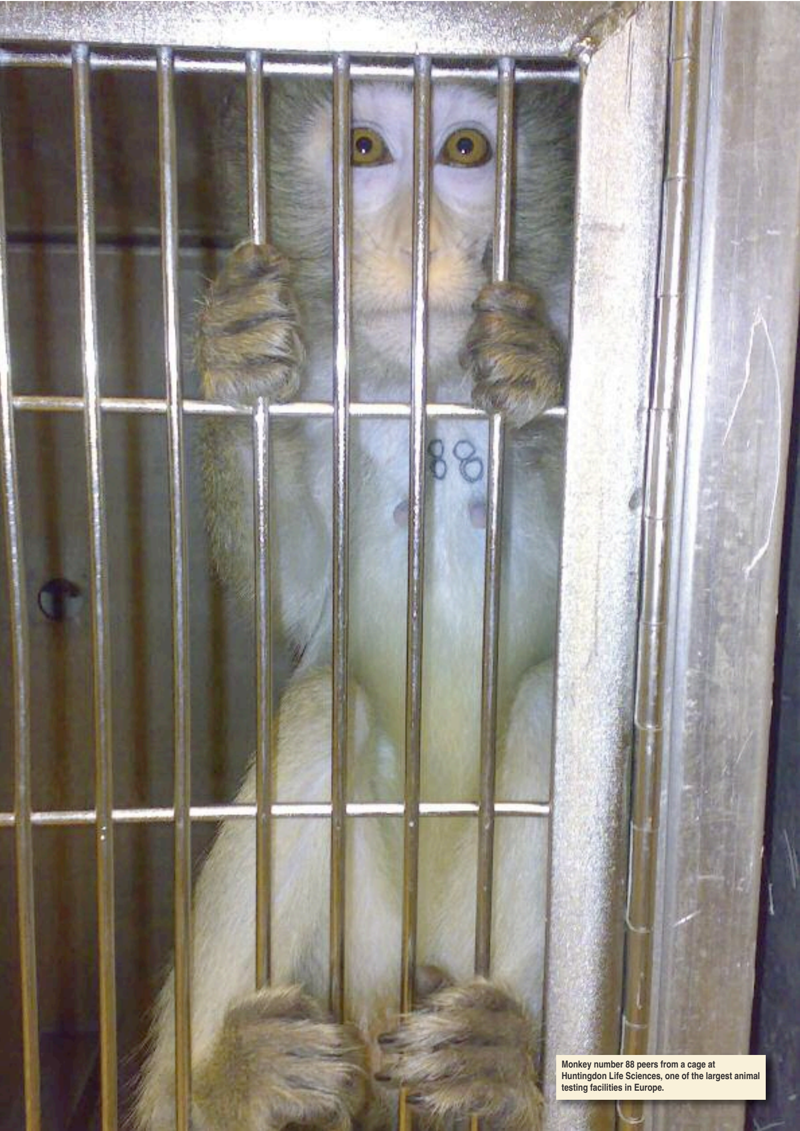
Monkey number 88 peers from a cage at Huntingdon Life Sciences, one of the largest animal testing facilities in Europe.