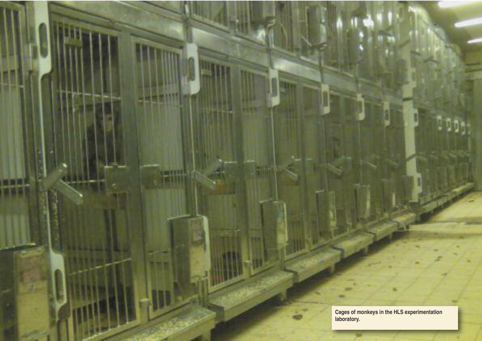
Cages of monkeys in the HLS experimentation laboratory.

Replacement of primate use with advanced techniques, or other sources of the information being sought, is good for European science and industry, as well as for primates.