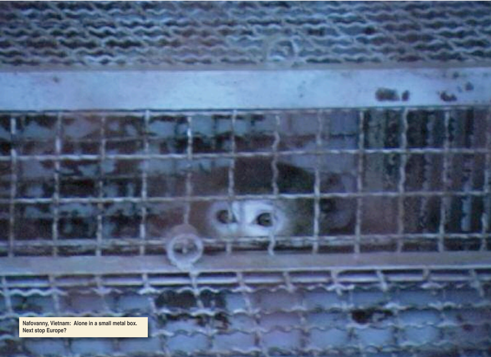
Nafovanny, Vietnam: Alone in a small metal box. Next stop Europe?

Mauritius 26 . During the period of the investigation, the monkeys were supplied by Nafovanny in Vietnam via Belgrave Services 27 . This included at least eight deliveries of monkeys that were, on average, two years of age (therefore juveniles):