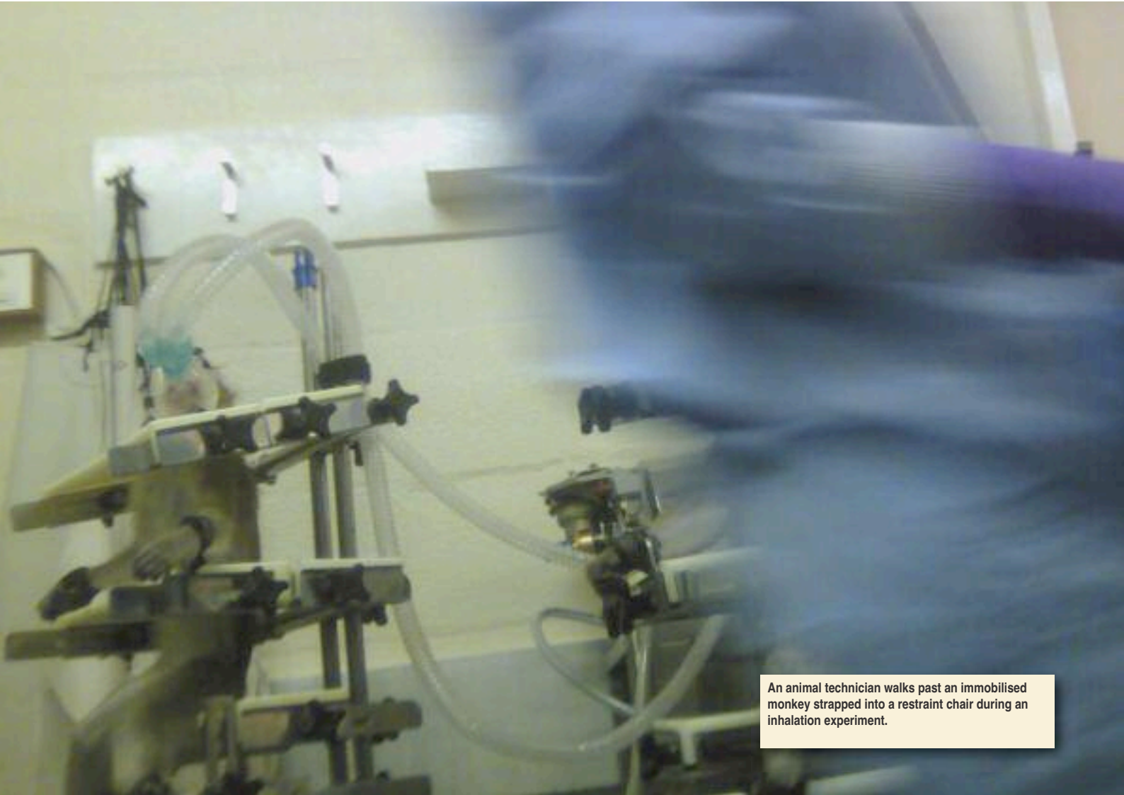
An animal technician walks past an immobilised monkey strapped into a restraint chair during an inhalation experiment.

Great Apes ” and encourage “ European initiatives aiming at eliminating the need for NHP [non-human primates] ” 4 .