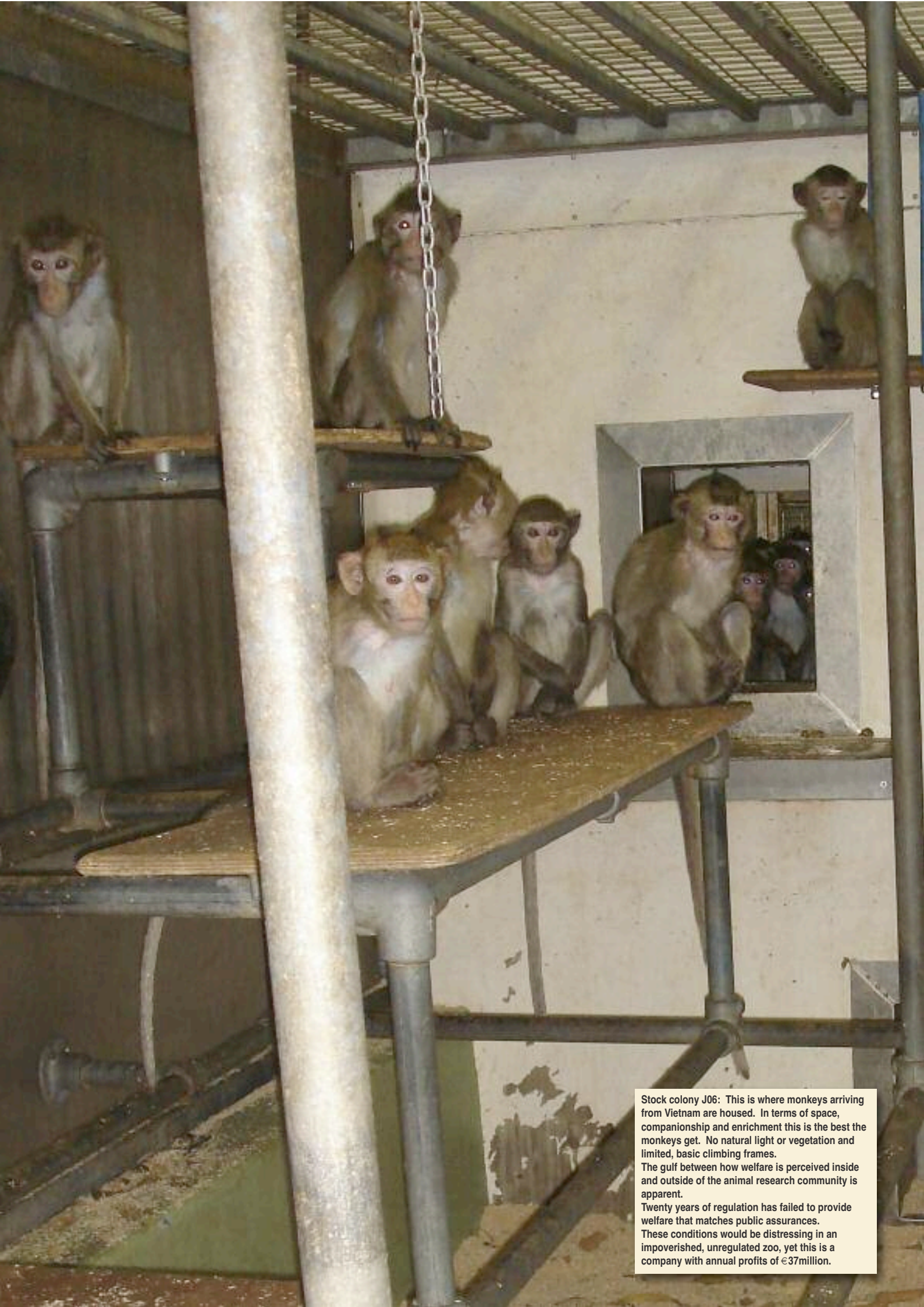
Stock colony J06: This is where monkeys arriving from Vietnam are housed. In terms of space, companionship and enrichment this is the best the monkeys get. No natural light or vegetation and limited, basic climbing frames. The gulf between how welfare is perceived inside and outside of the animal research community is apparent. Twenty years of regulation has failed to provide welfare that matches public assurances. These conditions would be distressing in an impoverished, unregulated zoo, yet this is a company with annual profits of €37million.